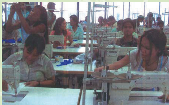
Learning Toymaking at ITMT, Kolkata

Institute of Toy Making Technology (ITMT), Kolkata: ITMT, Kolkata and Shillong Centre have been released an amount of Rs. 40.20 lakhs as the first instalment, against