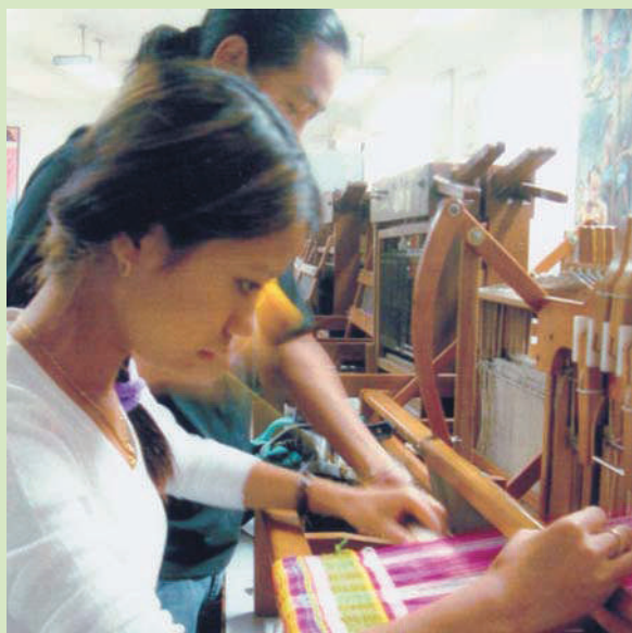
Training programme at NIFT, Kolkata