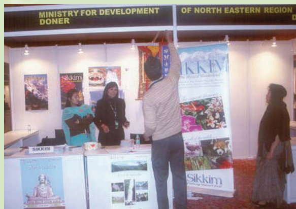
Tourism Meet in New Delhi