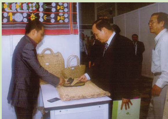
Exhibition on Unique Handicrafts of North East in Vietnam

as well as outside it so as to examine the business potential and resource management of the North East with the objective of bringing it at par with the average economy of the country and also catching attention of foreign investment. Thus while the NE Business Summit, Guwhati (by ICC) and NE India Investment Summit (by CII) successfully tapped the business potential of the North East within the country, the NE India Investment Summit held at Vietnam successfully managed to tap foreign investment.