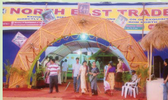
North East Trade Expo in Goa