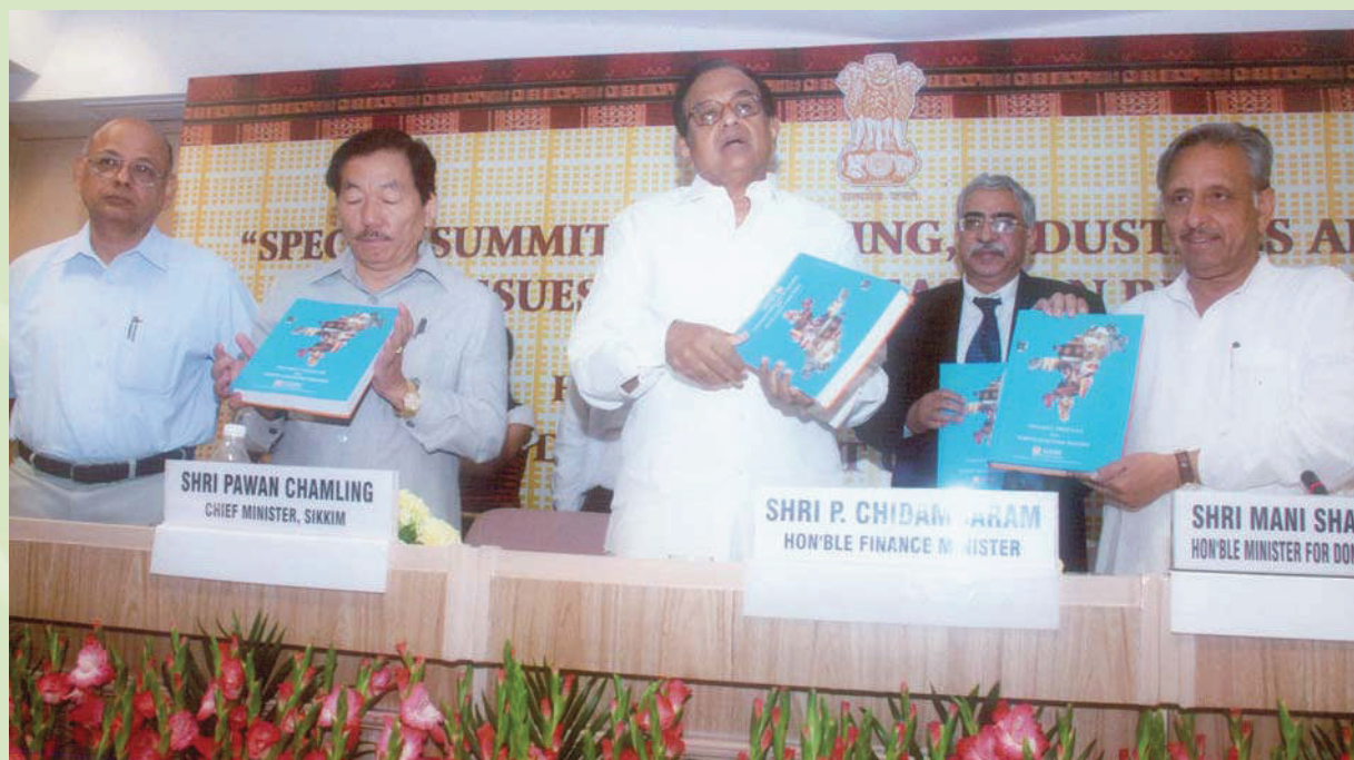
Union Finance Minister Shri P. Chidambaram at Special Summit on Baking

To accelerate the process of the development of the North East Region, it was felt desirable to analyse key sectors affecting the socio-economic development of the region. Therefore, at the initiative of the Hon'ble Minister DoNER, a decision was taken at the 53rd Plenary of the North Eastern Council held at New Delhi in November, 2006 to organize Sectoral Summits. The important decisions taken and implemented in pursuant to Sectoral Summits already held are analysed as under:-