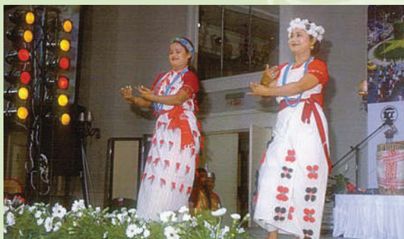
Promoting the North East Region Cultural Evening at NEIIT Summit

proposals under active consideration or under implementation. It is hoped to exponentially increase the number of these North-East-Thai joint ventures over the next four quarters in the four identified sectors.