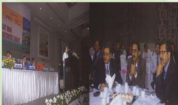
ASEAN North East India Investment & Trade Opportunities Summit, Vietnam