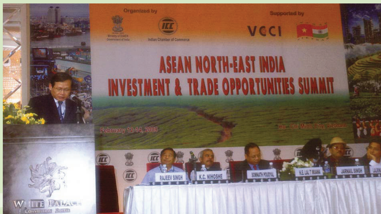
ASEAN North East India Investment & Trade Opportunities Summits in Vietnam

India's relationship with Association of South East Asian Nations (ASEAN) is central to her Look East Policy enunciated by the Ministry of External Affairs . The Look East Policy of the Government of India has been evolving since early 1990s and India has significantly deepened her interaction with ASEAN.