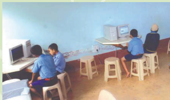
IT skills for tribal boys- R.K. Mission School, Arunachal Pradesh

Similarly, North East Development Financial Institution (NEDFi) has been roped in to provide training to potential exporters in the region for promoting the international trade. NEDFi will be conducting workshops and will also conduct exposure trips to outside the Region. The total cost of the project is Rs 41.50 lakhs and Rs 20.75 lakhs has been released.