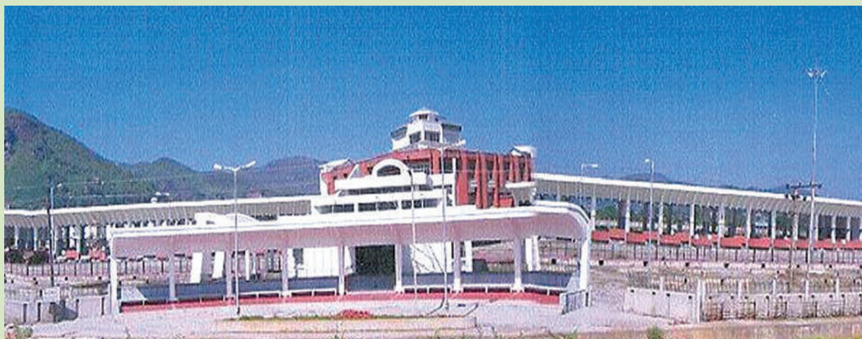
Inter-State Bus Terminus, Guwahati

improvement is done by AAI for which 60% of the funding is provided by NEC. Improvement of seven airports have already been completed and works on Silchar, Dibrugarh and Umroi are in different stages of progress. Out of an outlay of Rs. 20.00 crore for the airports, a sum of Rs. 10.00 crore have already been released.