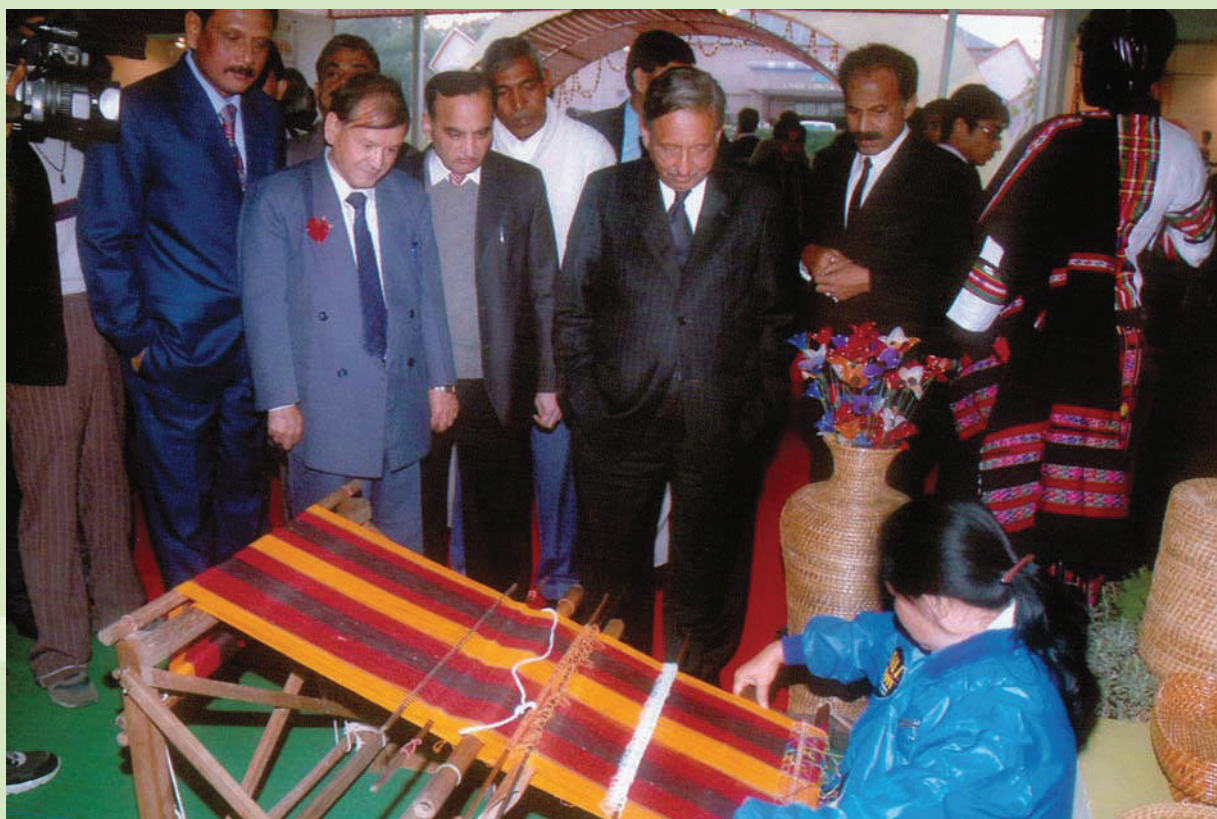
North East Trade Expo in New Delhi

The Plan Scheme of Advertising & Publicity has been formulated essentially to project the inherent potential and achievements of the North Eastern Region and to create an awareness of its unique and distinctive features and products. It also seeks to highlight the role of the Central Government in facilitating development process through appropriate strategies. Another vital objective of the Scheme is the mainstreaming of the NE Region.