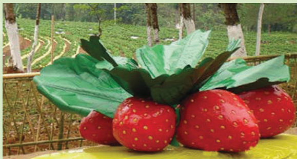
Strawberry cultivation, Umsning, Meghalaya

project has been completed in the state of Meghalaya and Tripura. The main objective of the project is to increase food grain production and bring self sufficiency in the region. Emphasis was given to produce paddy in Kharif season using high yielding variety and leguminous & vegetable crops in Rabi season. During Rabi season, the farmers of the region, after the NEC's intervention, have started growing wheat, pea mustered and some vegetables crops. As a result of the initiative, the income level of the farmers has improved in the project area.