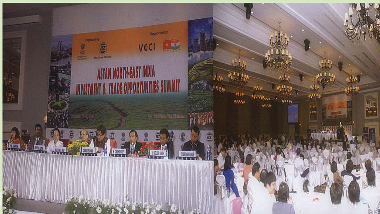
Session on Tourism at North East India Investment & Trade Summit

Efforts are being made by the Ministry to encourage external trade from the region. To start with, the emphasis is on encouraging trade with the neighbouring countries. Several business summits have been arranged to achieve the objective both within India and abroad. The latest summit that was held in this regard was held at Guwahati on 15-16 September, 2008 and was fourth in the series of such summits.