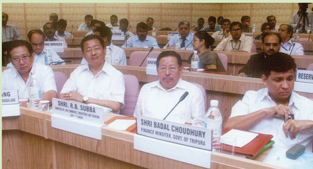
State Finance Ministers (Summit on Banking & Industries)