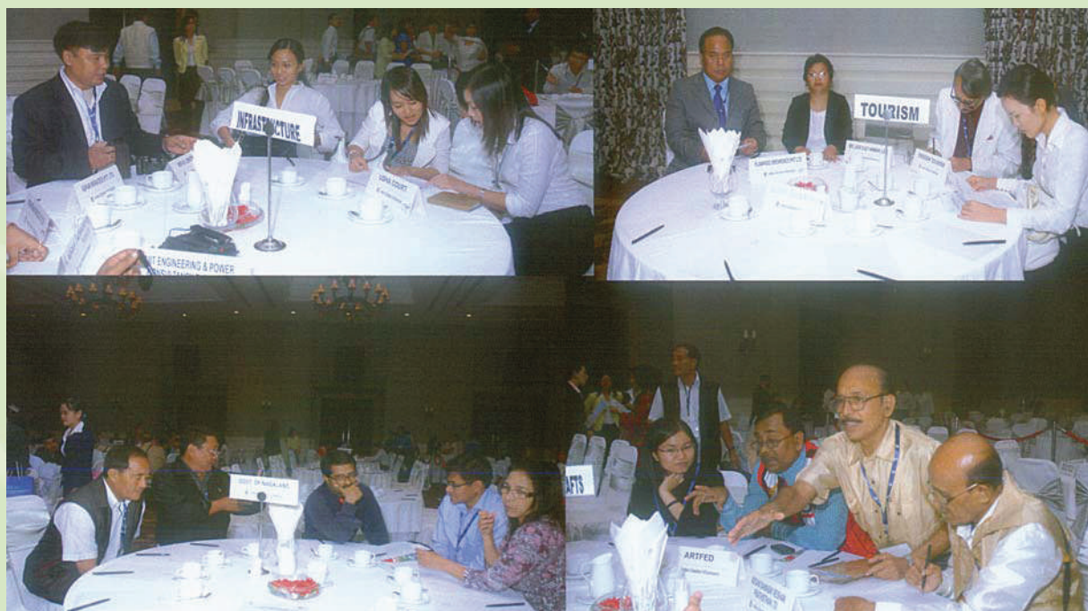
One-to-One Exploration Meetings at NEIIT

fortnight of October. Given the scientific way he has gone about organizing Czech-NER business relations, he was invited to deliver a very well-received special address at the Summit. He did so with considerable effect.