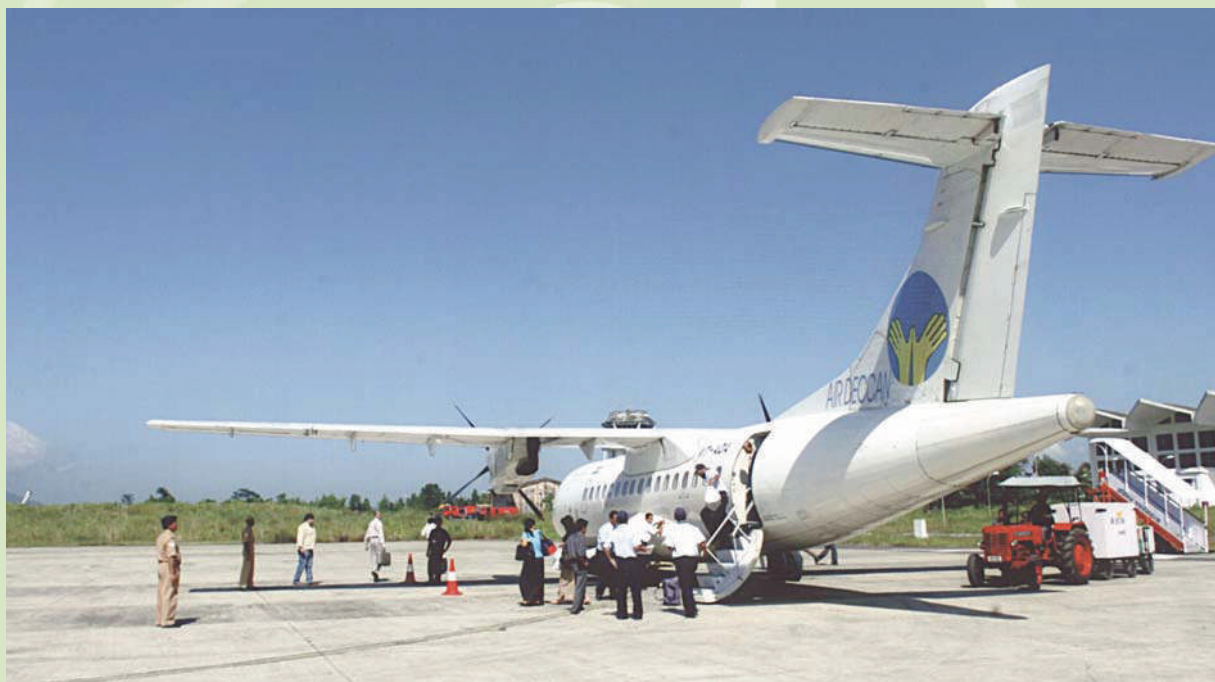
Lengpui Airport, Mizoram