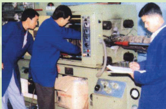
Practical Training at CIPET, Chennai

objective of enabling them to become professionals in this sector. The Institute will be providing training to 30 trainees each at its 3 Centres at Gwalior, Bhubaneswar and New Delhi at a total cost of Rs. 73.80 lakhs.