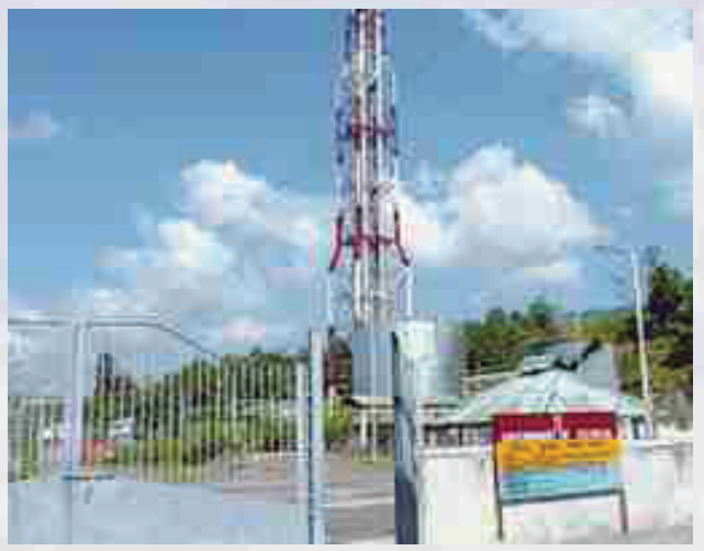
Thermal Power Plant, Mizoram

4.1 The Union Cabinet had approved constitution of a Central Pool of Resources on 15.12.1997(NLCPR), was created in 1998 for accrual of the unspent balances out of the 10% earmarked in their budget by various Ministries/Departments for North Eastern Region. The Ministry of Development of North Eastern Region (DoNER) are provided budgetary allocation for sanction