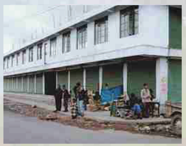
Shopping Complex at Mawphleng, Meghalaya

NLCPR during 2006-07 is worked out at Rs. 1307.11 crore (Provisional). The balance in the NLCPR as on 01.04.2007 is worked out at Rs. 5074.74 crore (Provisional).