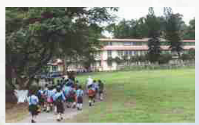
R.K. Mission Residential School at Narobtem Nagar, Arunachal Pradesh

4.4 The Planning and Development Department of each State has been entrusted with field inspections of the projects through senior officers of the State and submission of inspection notes. Besides, the State Chief Secretary has been entrusted with the responsibility of quarterly review of each of the projects and to send the proceedings of the quarterly review at the end of each quarter.