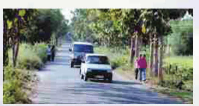
Dimapur Niuland Road (Nagaland)

4.7 In the wake of tripartite Memorandum of Settlement signed between Government of India, Government of Assam and Bodo Liberation Tigers in February 2003, a total of 39 projects have been sanctioned at an indicative cost of Rs. 413.18 crore since the year 2004 - 05 till 2007 - 08 (up to 30.11.2007). An amount of Rs. 277.92 crore has been released to the State Government / BTC authorities against these projects.