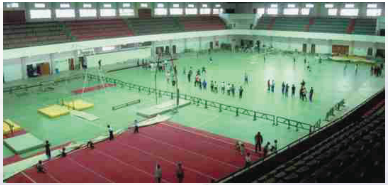
Sports Complex, Imphal

4.1 The Union Cabinet had approved constitution of a Central Pool of Resources on 15.12.1997(NLCPR), was created in 1998 for accrual of the unspent balances out of the 10% earmarked in their budget by various Ministries/Departments for North Eastern Region. The Ministry of Development of North Eastern Region (DoNER) are provided budgetary allocation for sanction