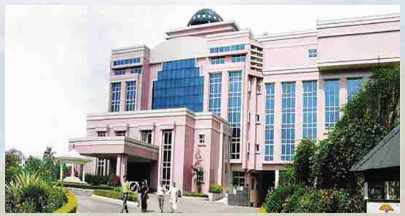
Sankardeva Nethralaya, Guwahati, Assam

* To improve the quality of teachers, NEC is working with North Eastern Regional Educational Council