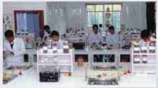
Student at Laboratory, Ripan