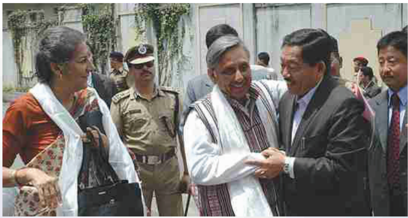
(L-R) Shri H.V. Lalringa, Secretary, NEC; Shri Mani Shankar Aiyar, Hon'ble Minister, DoNER; Smt. Ambika Soni hon'ble Minister of Culture

5.1 The North Eastern Council has been mandated to implement schemes and programmes that benefit the Region holistically and contribute to its physical and social infrastructure. Concerted efforts are being made by NEC to accelerate the completion of its existing commitments and further the development of the region.