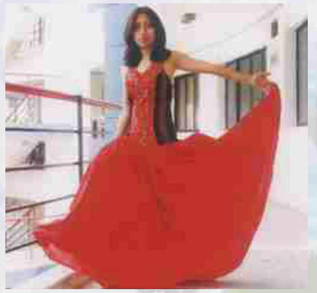
Garments Designed & Developed by CPFC Students

M/s Ashok Institute of Hospitality and Tourism Management New Delhi (Division of ITDC) has been selected for training about 125 youth in Aviation/Hospitaliy/Tourism fields. Ministry will grant assistance to extent of 90% (i.e.) RS 1,00,12,500/- of the total cost of Rs 1,11,25,000/-