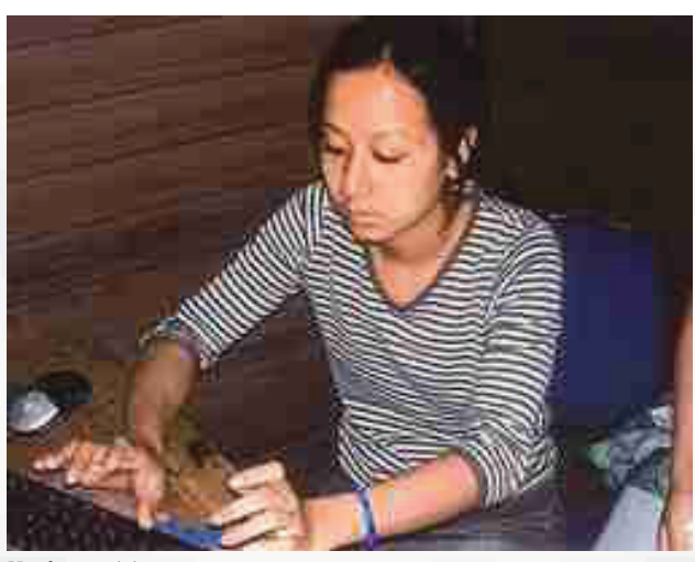
Hands on training