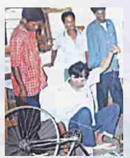
SEBA Exposure Trip to Sualkuchi Silk Producing Centre

NERAMAC has been supported for organizing Entepreneurship Development Programm (EPD) on Food Processing at a cost of Rs. 8, lacs.- The first instalment of Rs 4 lacs has been released.