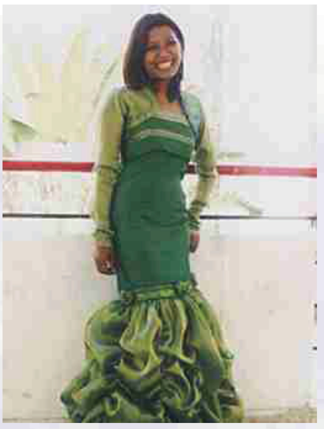
Garments Designed & Developed by CPFC Students

NIFT has been training unemployed women /girls in the fashion technology for the past so many years. During 2007-08 NIFT has been granted Rs. 92 lakhs for Certificate Programmes in Fashion Design Mgmt and Fashion & Clothings.