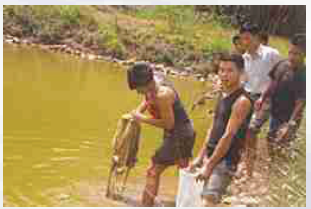
Fishery (Kingfisher) trainees (ToTs) getting hands on training on fishery