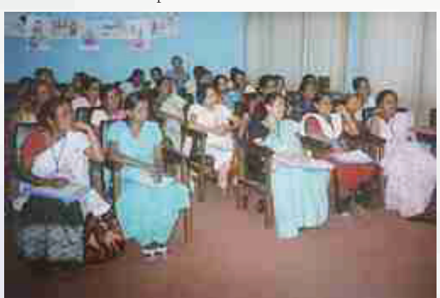
Training Programmes on STI & HIV/AIDS.