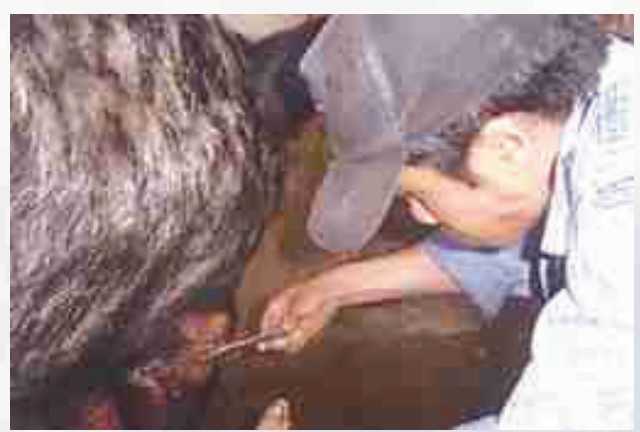
Trainees learning the technique of castration at RRTC, UMRAN