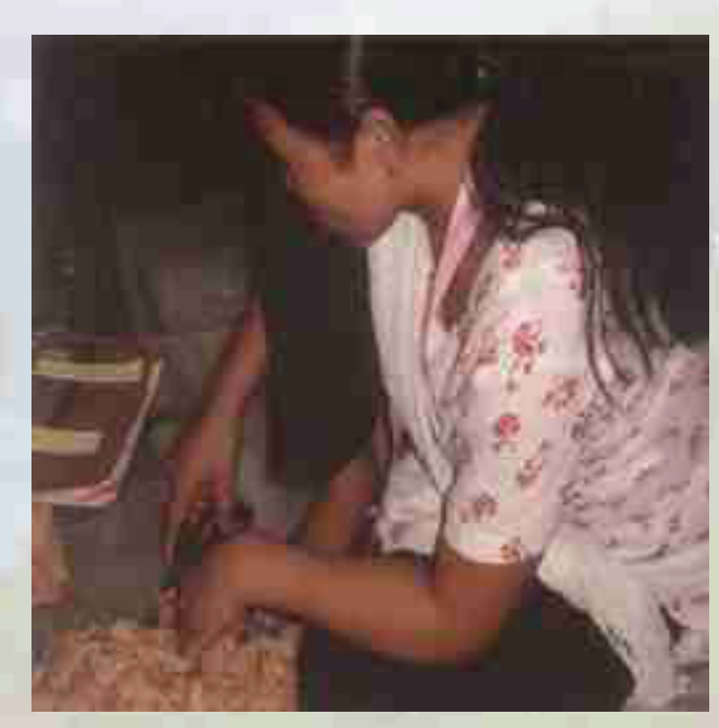
Training at Cutting Section