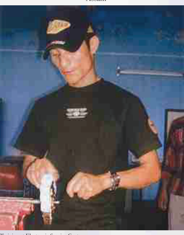
Training at Electronic Service Centre