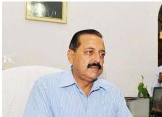
Minister of state for the development of the Northeastern Region (DoNER) Jitendra Singh

NEW DELHI : A newly-launched e-portal will help in the submission, surveillance and follow-up of developmental projects in the northeast, a minister said on Thursday.