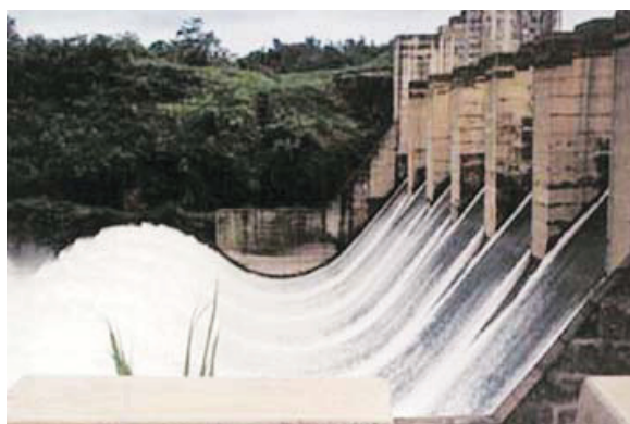
Khandong Dam, Kopli H.E. Project (275 MW), Assam

V. Infrastructure support for Soreng college in Sikkim, students Hostel in Manipur, music college in Nagaland, Infrastructure development in ITI, middle schools Hostels etc in Arunachal, etc is being provided.