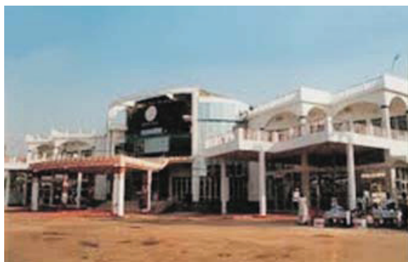
International Bus Terminus, Krishnanagar, Tripura