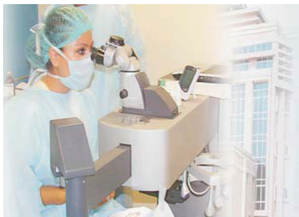
4th Generation Lasik Laser for treating eye defects at SSN, Guwahati.

16% so far. Forty system improvement schemes, comprising 28 Sub-Stations and 12 Transmission Line projects, spread over all the eight States of the region are being supported.