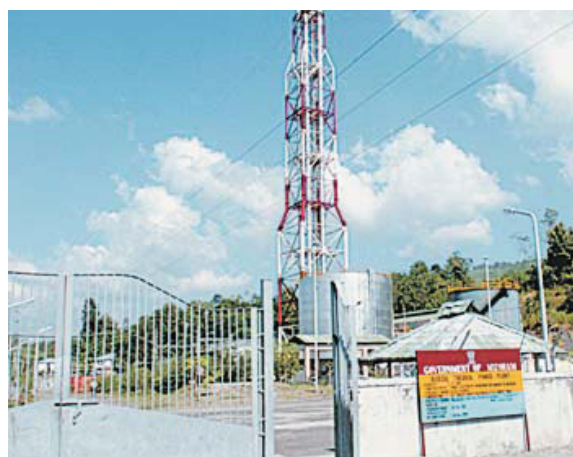
Thermal Power Plant, Mizoram

of Rs.2802.17 Crores, out of which the NEC is 65%, i.e Rs.1832.11 Crore.