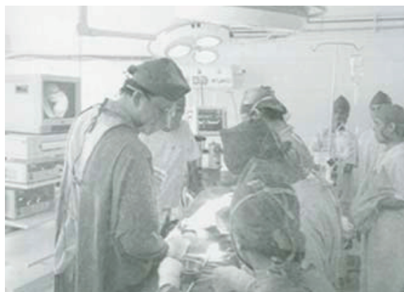
Laprosopic Surgery at BBCI