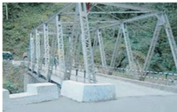
Upper Ben Khola bridge, Sikkim