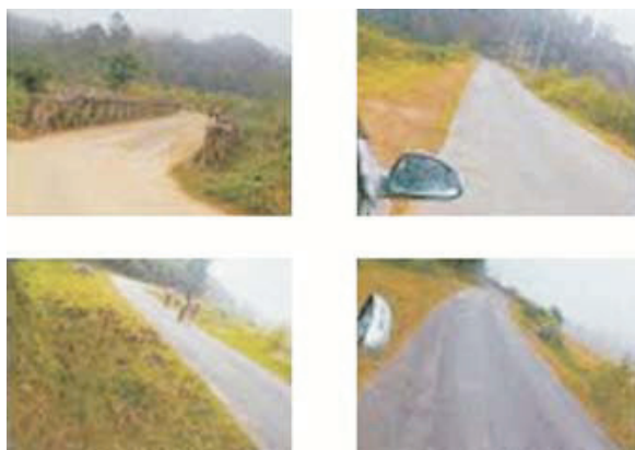
Silchar-Dwarbond-Gaglacherra road in Mizoram