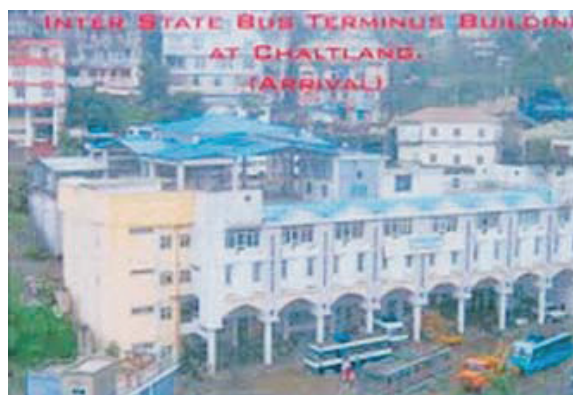
ISBT Chatlang, Mizoram