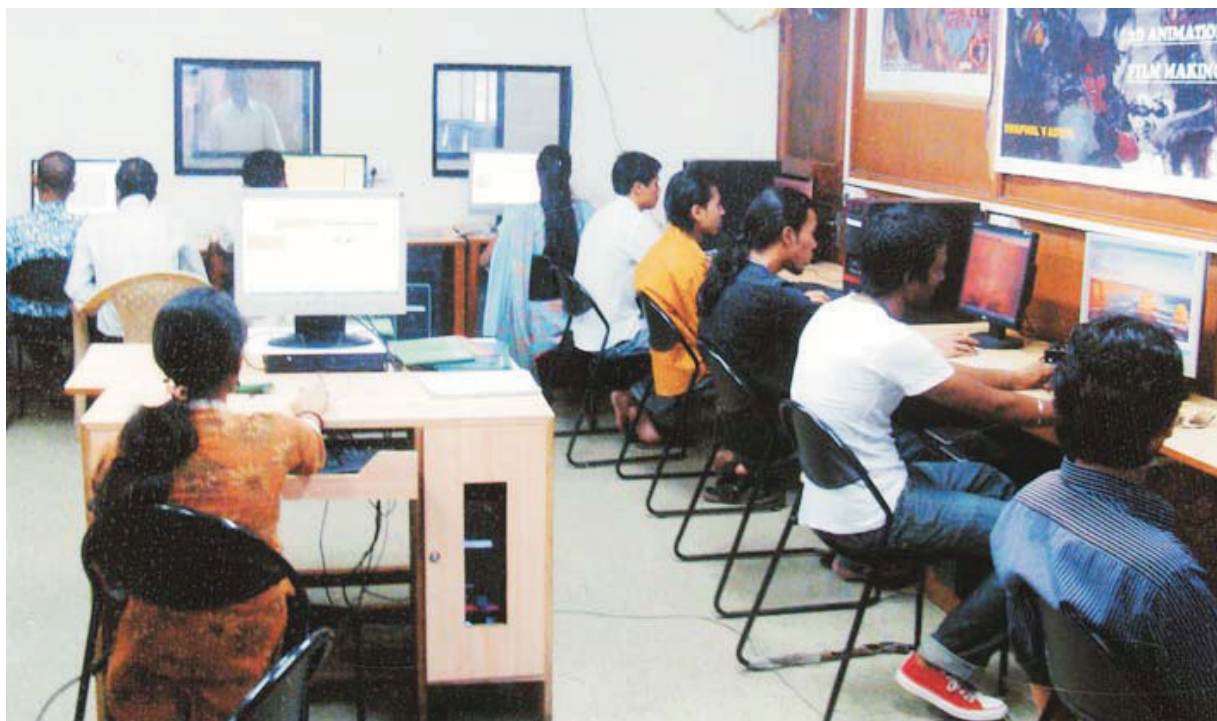
NE students undergoing skill training programme in IDEMI, Mumbai