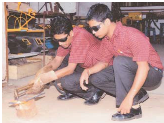
Training in welding by CIPET, Bhubaneswar