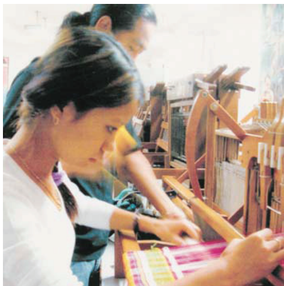
Training in Handlooms