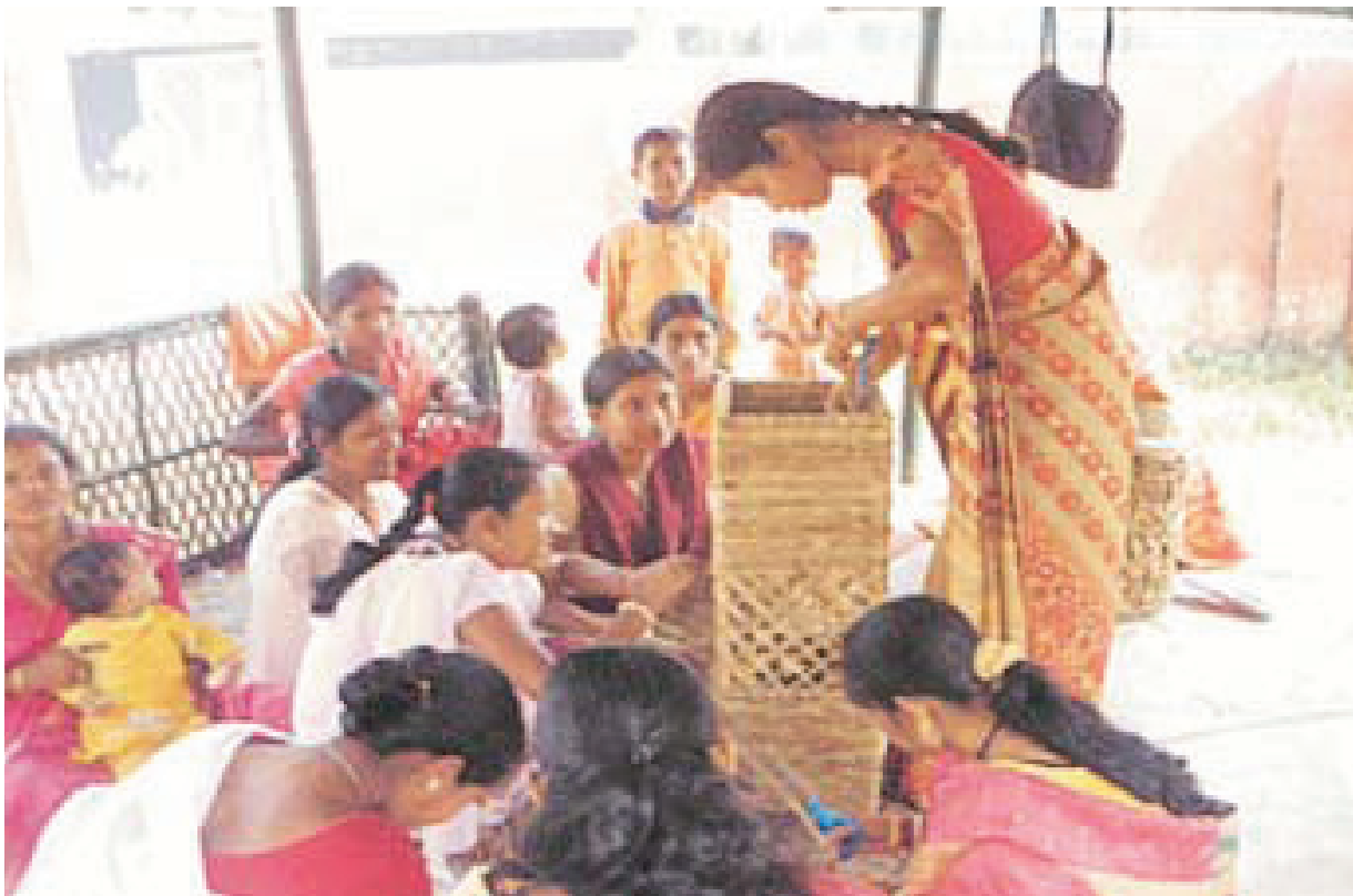
Craftsmanship training in Bamboo

2010-11 are expected to find placements in various organizations.