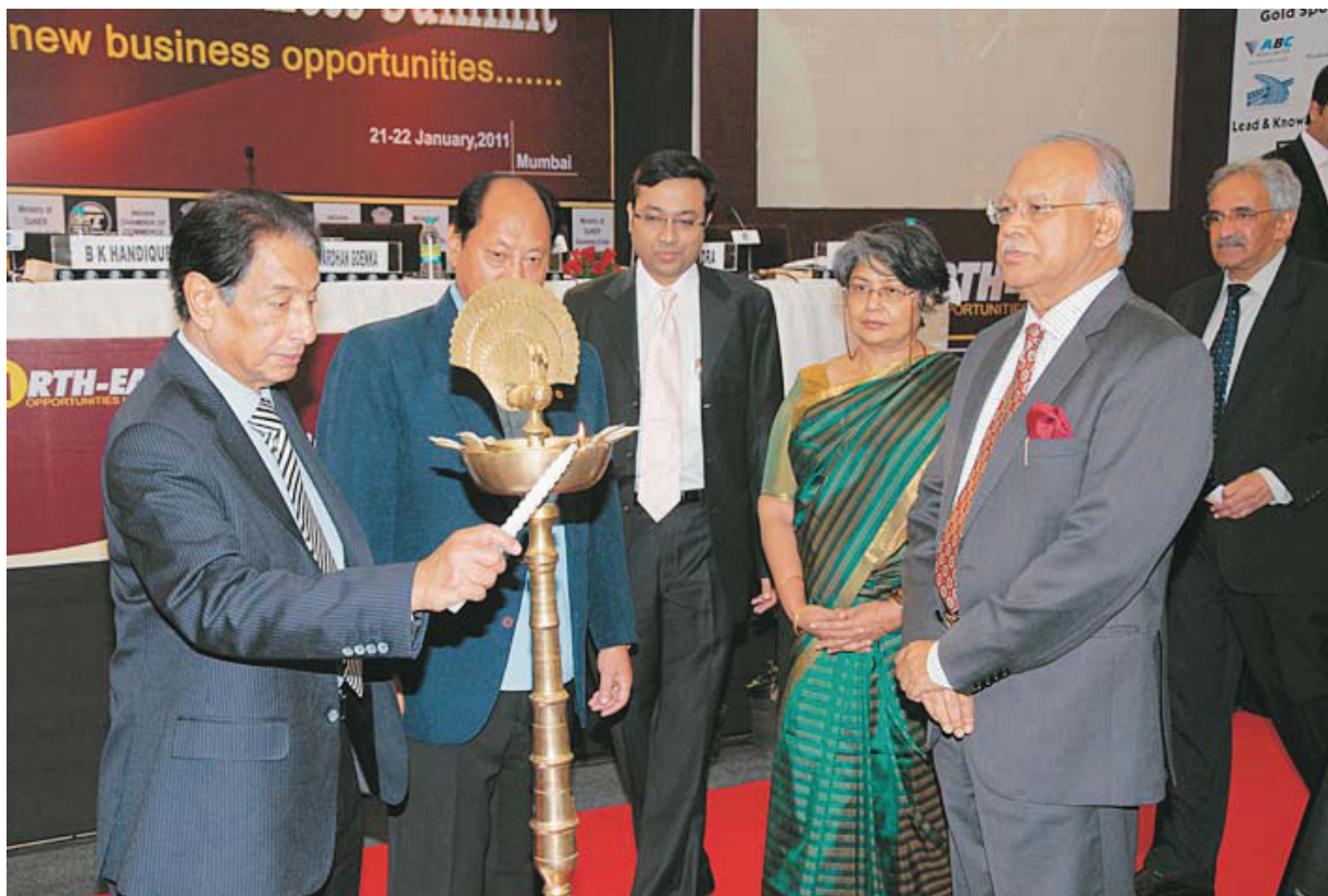
Inauguration of 6th North East Business Summit in Mumbai by Hon'ble Minister DoNER