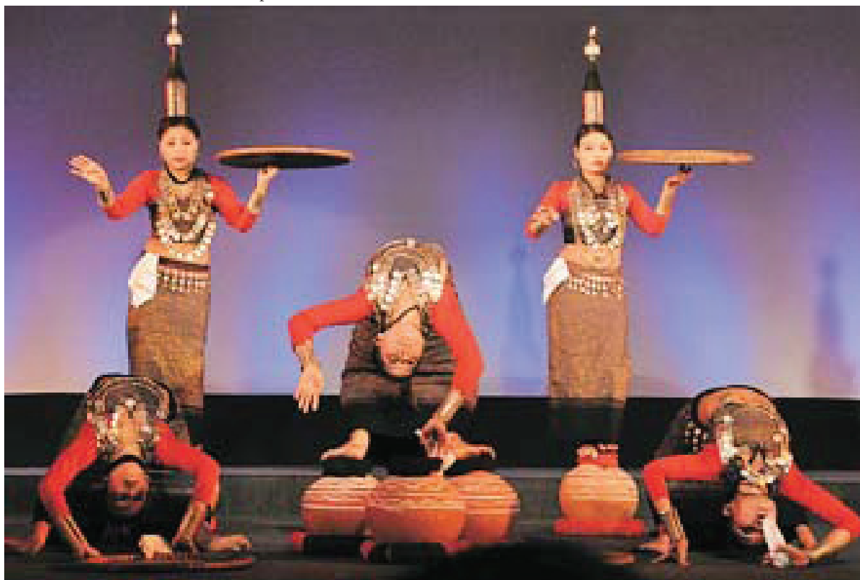
Performance by Cultural troupe during Pravasi Bhartiya Divas, 2011