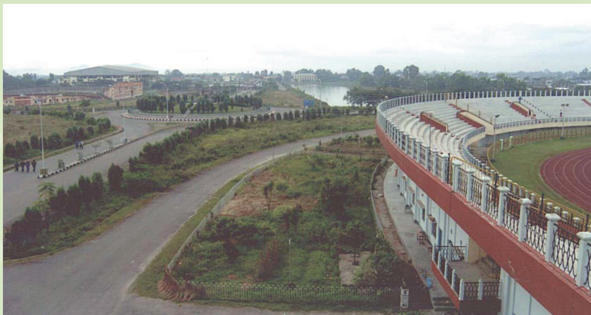
Sports Complex, Imphal (Manipur)