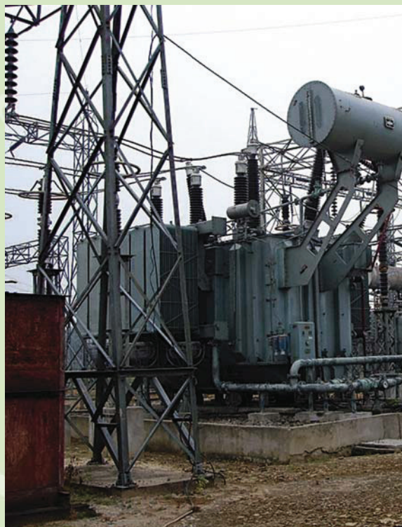
Augmentation of 220/132 KV 2x50 MVA SS in Mariani to 2x100 MVA (Transformer I & II) in Jorhat district of Assam