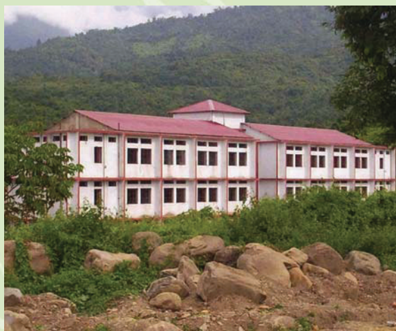
Sainik School campus in Pungalwa in Nagaland