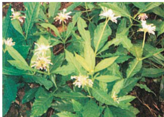
Agar Plantation at Golaghat