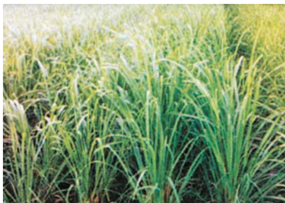
Lemongrass Plantation in demonstration field

3.4 This Annual Plan 2010-11 of Agriculture and Allied Sector, NEC was drawn up by incorporating inputs from the recommendation made in the Vision 2020 document, decisions arrived at in the meetings of the NEC and other relevant inputs. Issues such as Double Cropping, Organic Farming, Horticulture/ Floriculture/ Animal Husbandry/ Fishery developments etc. are some of the areas where the region requires impetus for improvement and self sustenance.