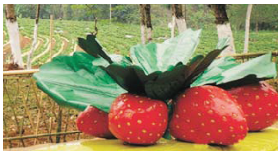
Strawberry cultivation, Umsning, Meghalaya