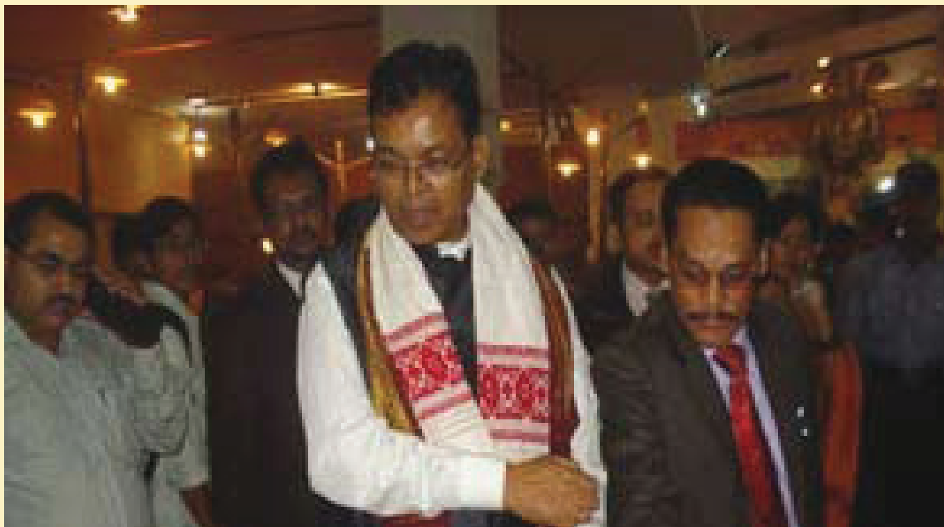
Shri Paban Singh Ghatowar, Hon'ble Minister of DoNER visiting the Water Hyacinth Gallery during the IITF 2011